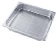
GN 2/3 Perforated Pan 65mm (d)