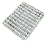
GN 1/1 Mini Idly Tray