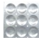
GN 2/3 Idly Tray