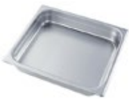
GN 2/3 Pan 65mm (d)